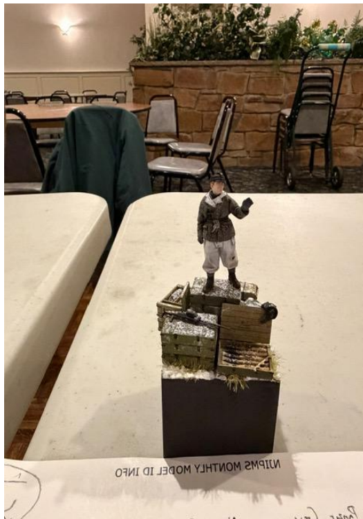
Eric Schroeter brought in Alpine Miniatures 1/35 winter panzer crew. The shell boxes are Miniart.