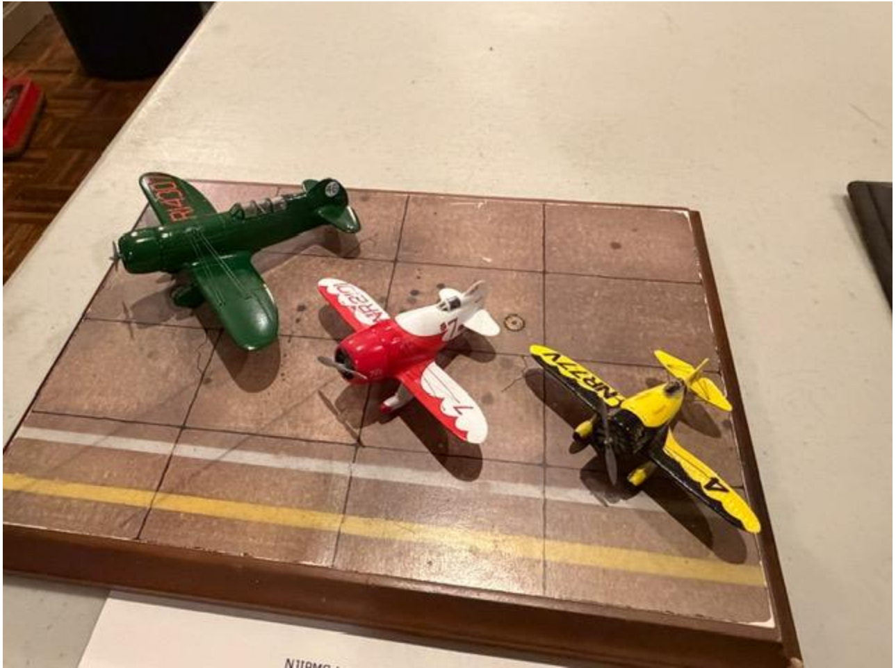
Bill Connally brought in the “The Gee Bees”. Read that again...great play on words! All 1/72 scale OOB from AModel, SBS Design, and Drevino Models.