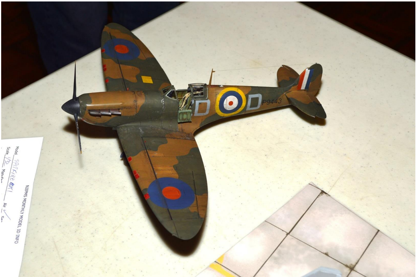
Marc Rocca built Kotare's 1/32 Spitfire Mk I. All o the markings are masked and painted. Marc added after-market seatbelt, tires and exhausts.