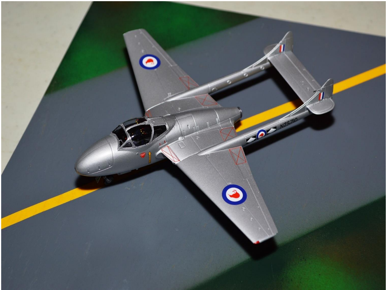
Antonio Merolli built Airfix 1/72 DH Vampire T.11. Antonio painted the ejection pulls and some brighter controls in an otherwise black cockpit.