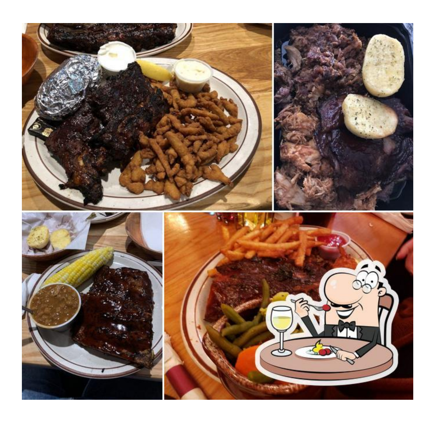
Looks like we'll be eating good!!