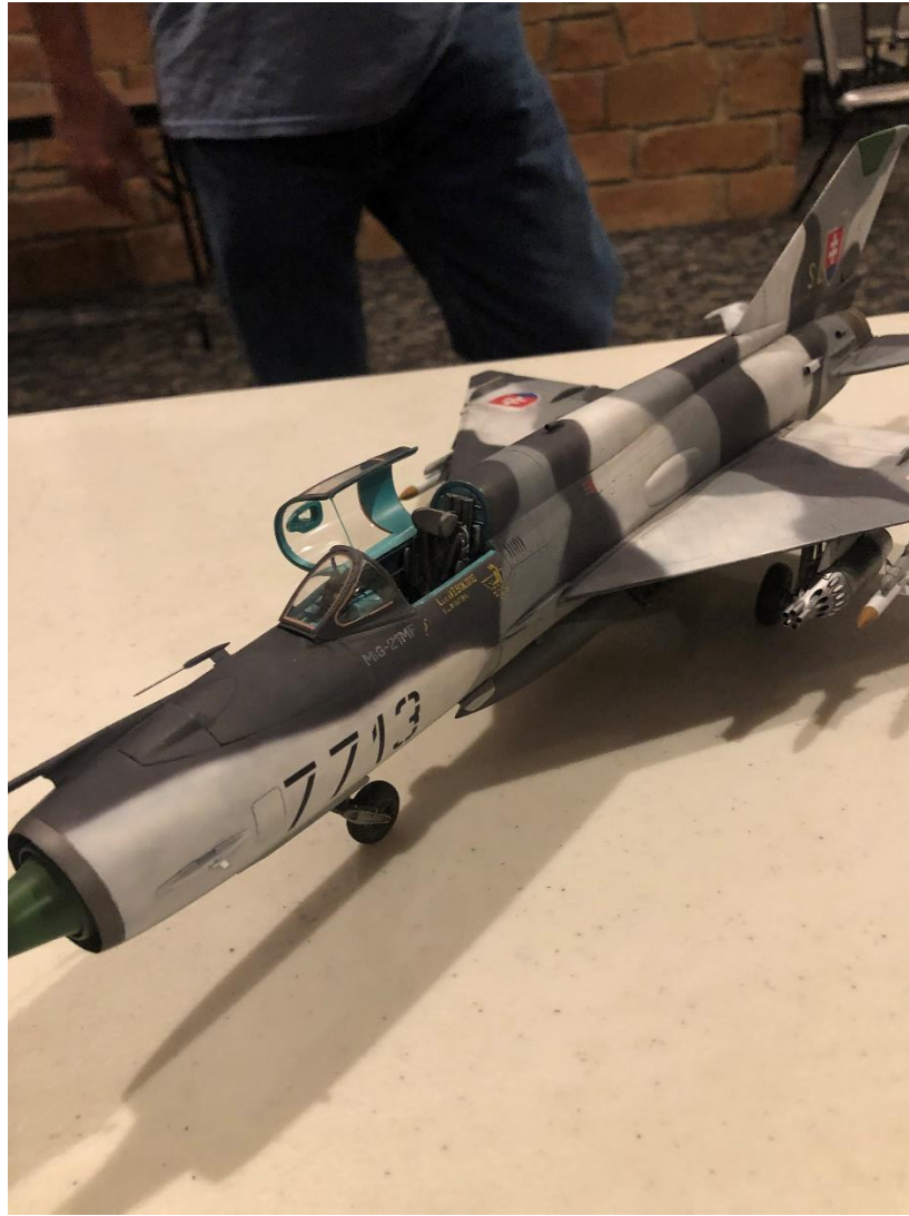
Marc Rocca Trumpeter Mig-21MF in 1/32 scale. Marc painted all of the markings, added and Red Fox 3D Cockpit details.