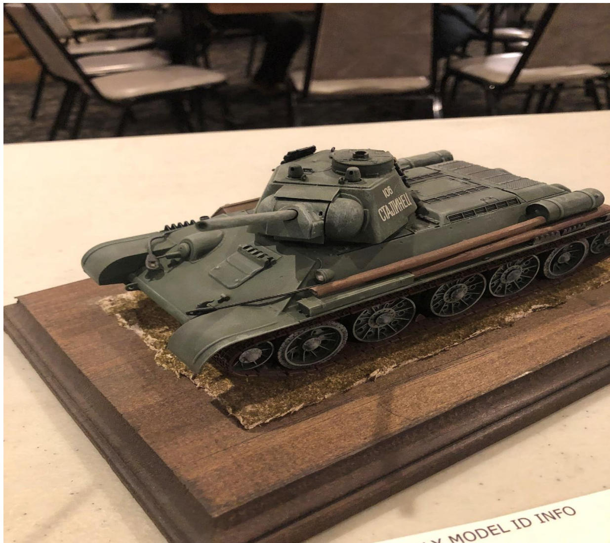
Patrick O'Connor showed a Tamiya 1/35 T-34/76 from 1943

Now on to the models on the table in October