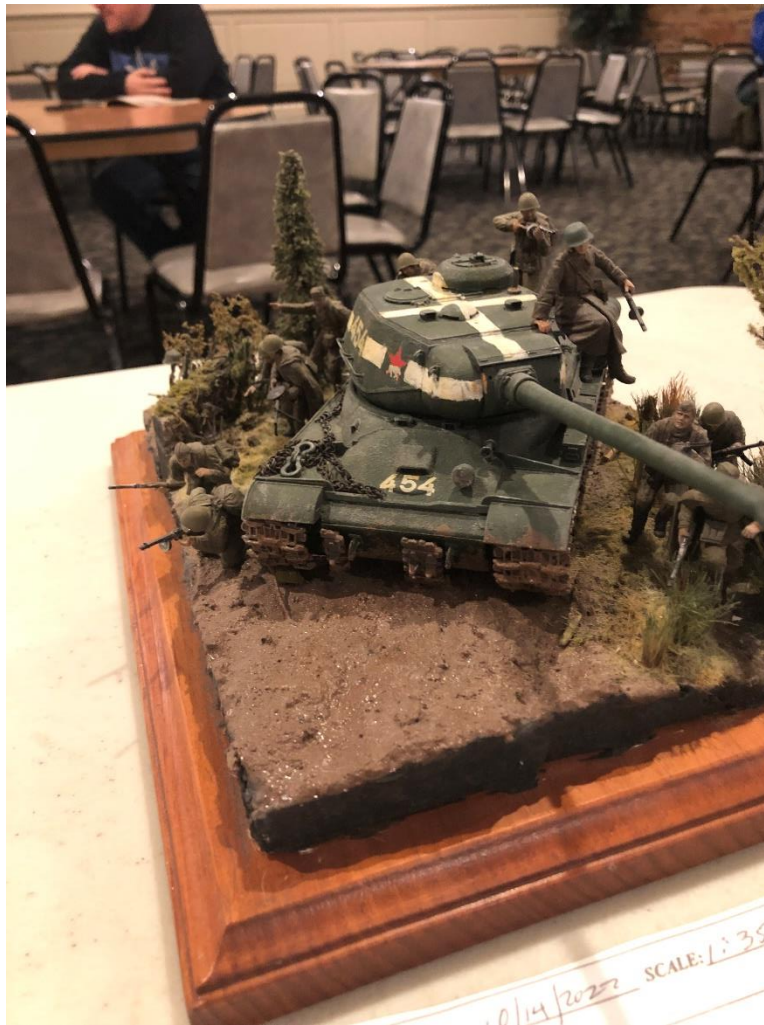
Jerry also brought in this cool diorama of a T-34 with Russian Infantry figures in 1/35 scale.