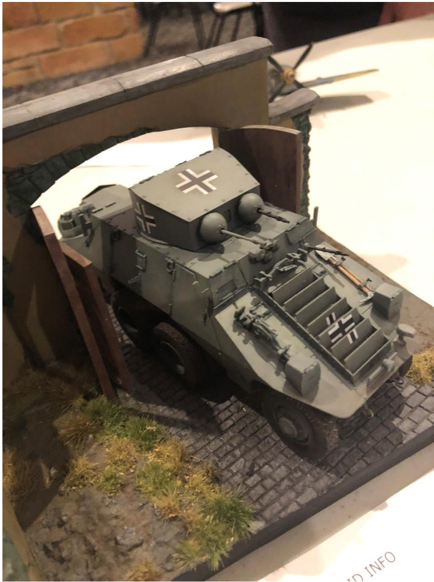
Dave DeNardo brought in a HobbyBoss 1/35 M-35 Mittlere Panzerwagon. Only a few were built, and the SS used them for crowd control.