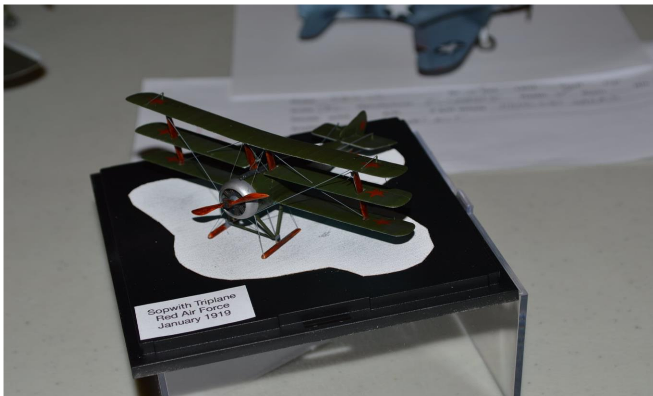
Mike Terre brought in a Revell 1'72 Sopwith Triplane in Russian markings. Painted with PolyScale; the skis, pitot tube, air pump and cockpit details were scratch-built. MicroScale supplied the markings.