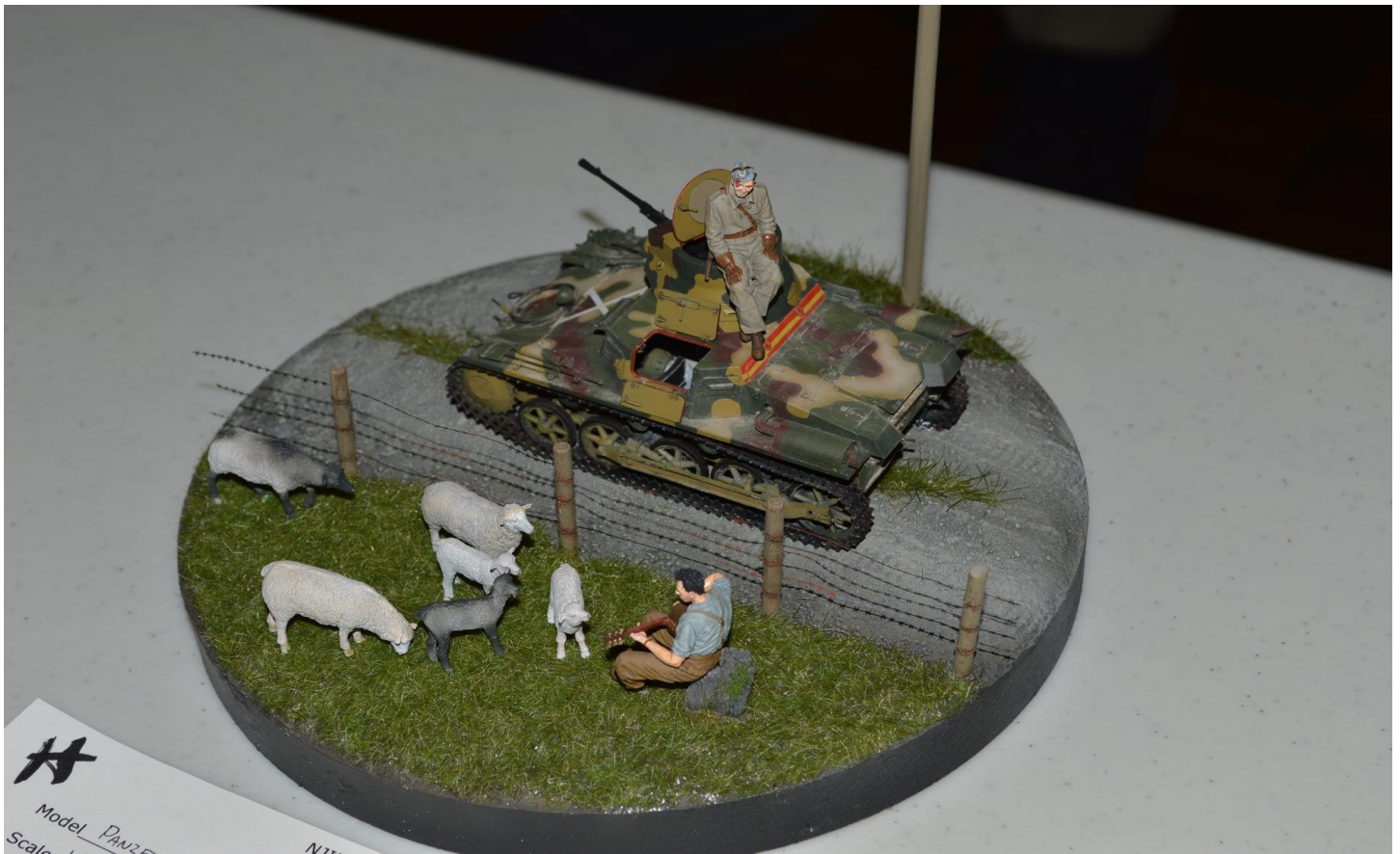
Eric Schroeter's little diorama of a crew of a 1/35 Breda Panzer 1 in Spain-serenading the locals! Added were a Dragon full interior, an Aber metal barrel, a 3-D printed gun breech from Shapeways. Figures are modified from Bravo 6 and Alpine; Sheep and pigeons from Miniart.