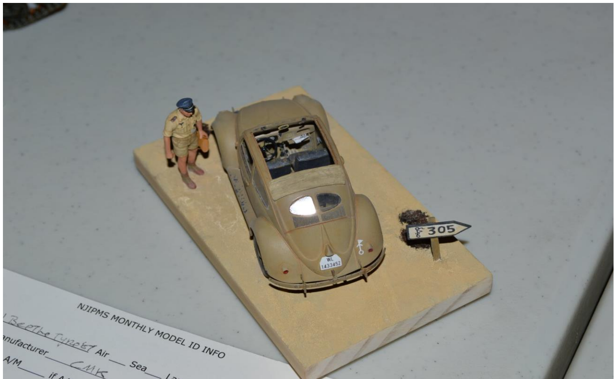
John Bucholz 1/35 CMK VW Beetle Tyro 87 An upcoming NL article will show the build.