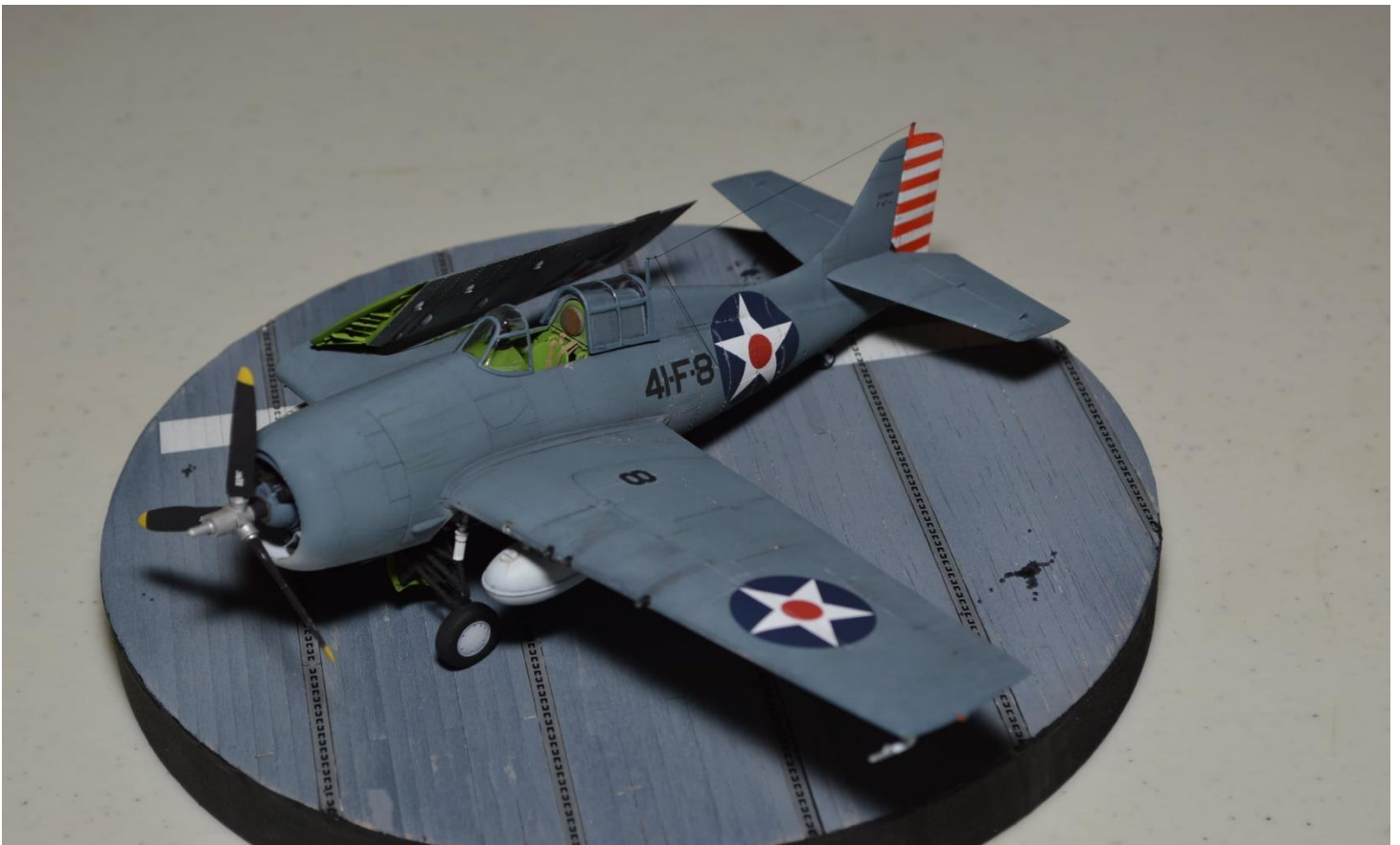
Eric Schroeter showed a Tamiya 1/48 F4F-4 Wildcat. Scratchbuilt wing fold, seatbelts, guns, and engine wiring.