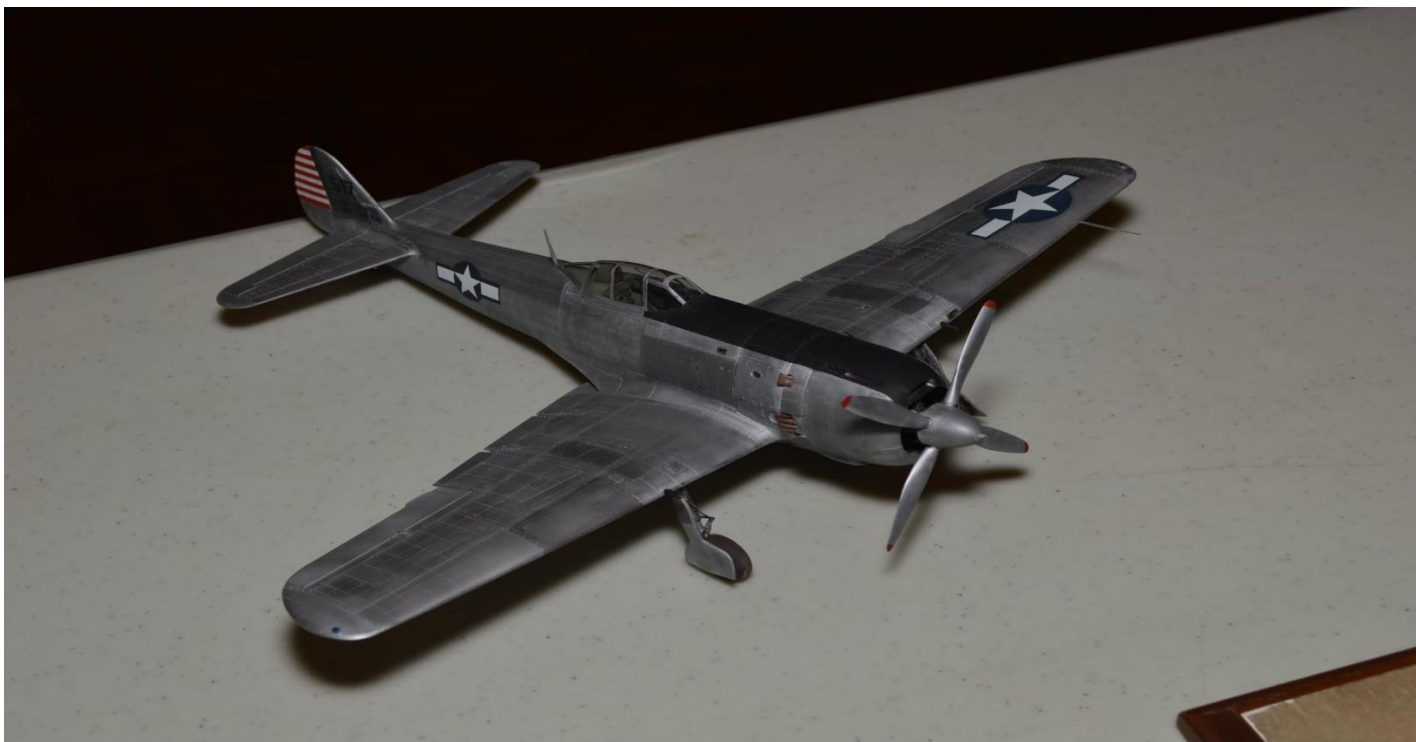
This 1/32 Hasegawa Ki-84, shown as captured did not have a signature on the tag.