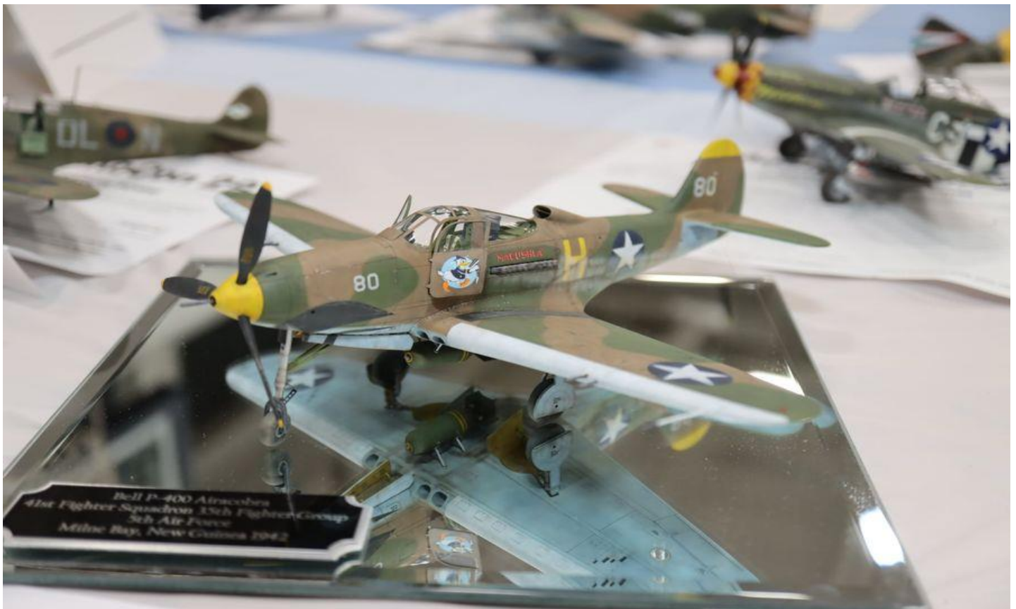
Best Aircraft, MosquitoCon 29: Bell P-400 Airacobra, by Chad Bowser