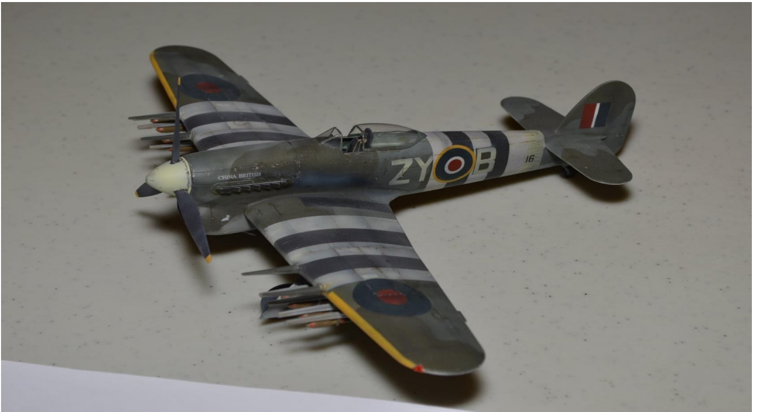
Bob LaPadura brought in a well done Tamiya 1/48 Typhoon Mk1b-excellent weathering!