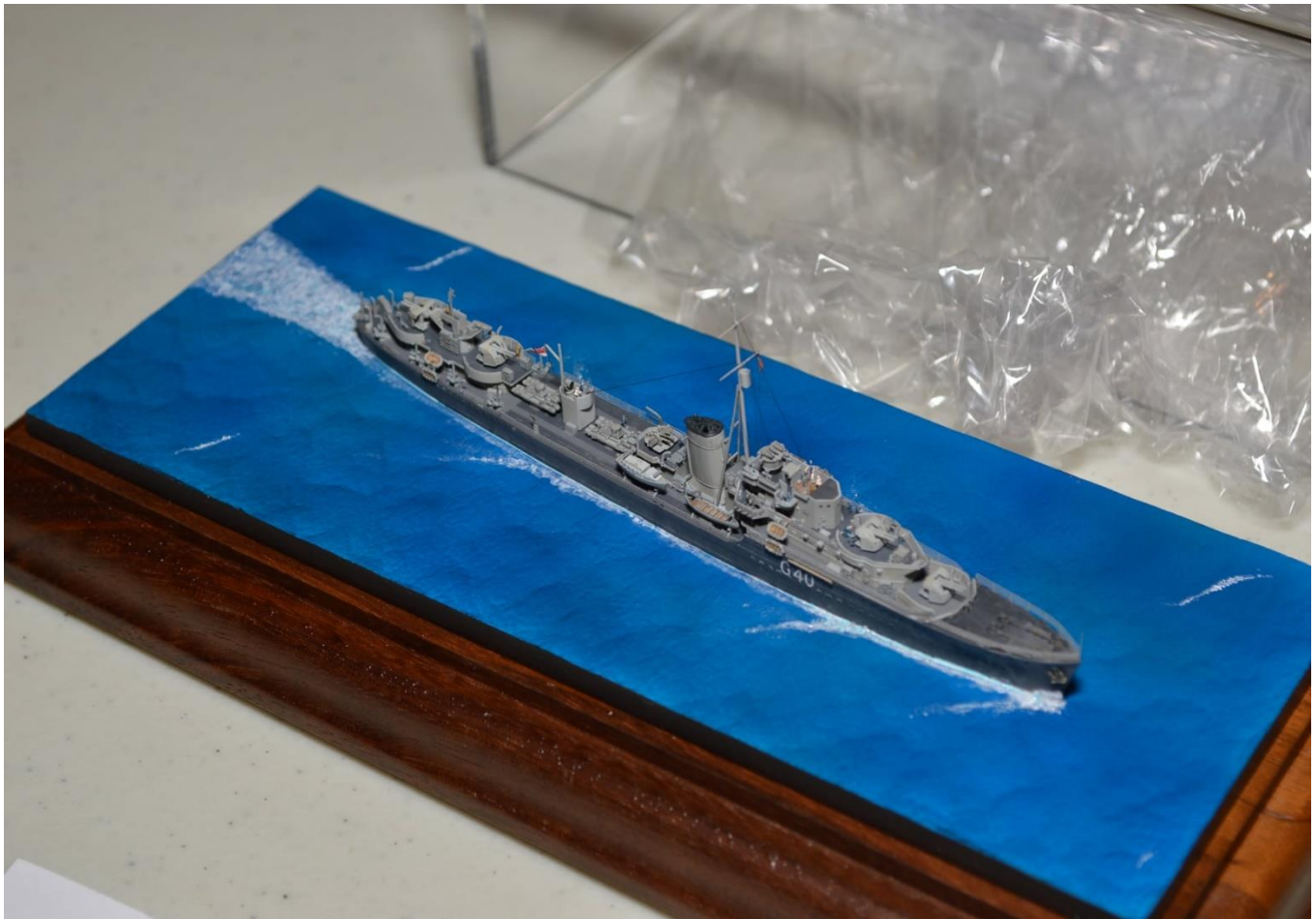
Devin Poore showed a very well done HMS Lively. A Flyhook kit in 1/700 scale.