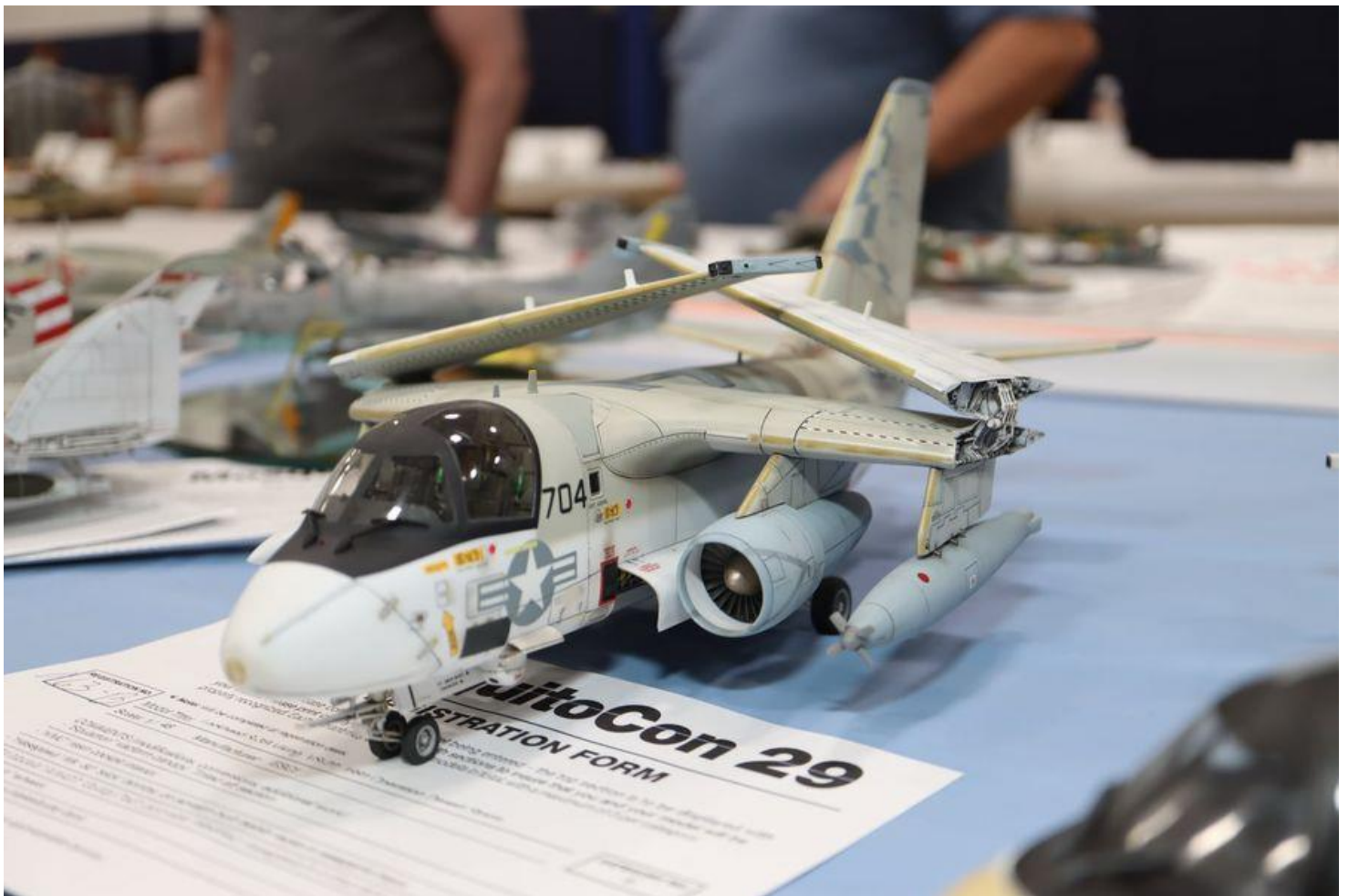
Best Tailhook (US Naval Aviation) Subject: S3B Viking