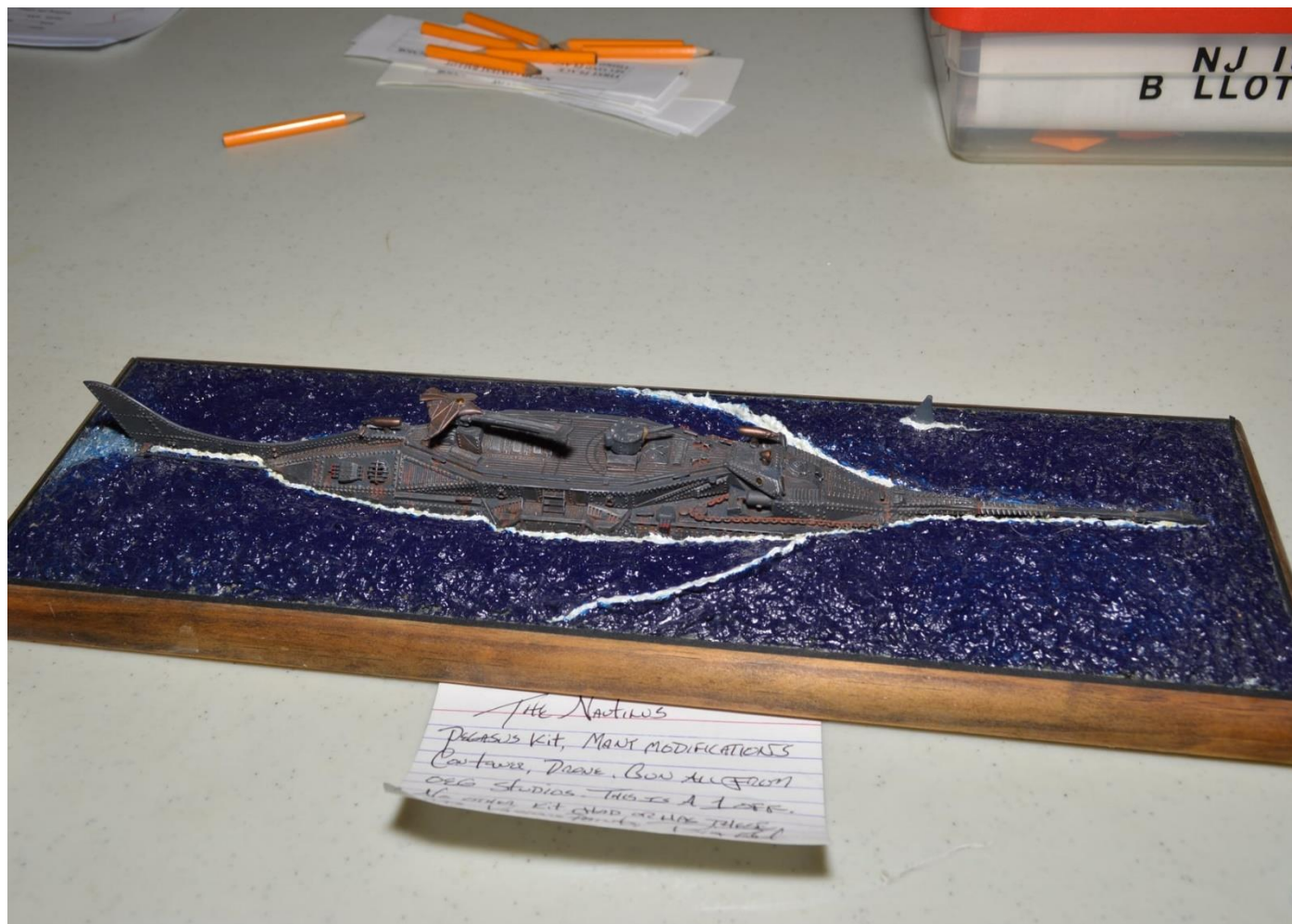
Big Bill also showed the Nautilus. Pegasus Kit, Many modifications-Conning Tower, Drone, Bow all from OEG Studios. Custom kit-no other had these parts!!!