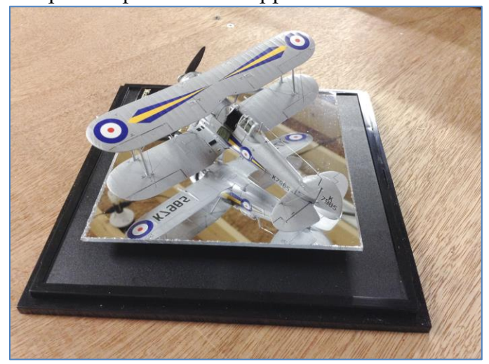
fuselage. Once dried the completed assembly was attached to the main fuselage, again, no filler needed, really remarkable!

Airfix uses an innovative system (reminds me of the system Monogram used years ago!) for its biplanes to insure proper wing alignment. The cabane struts (wing to fuselage) were molded as two assemblies. These were then glued into locating slots on a separate piece of the upper forward