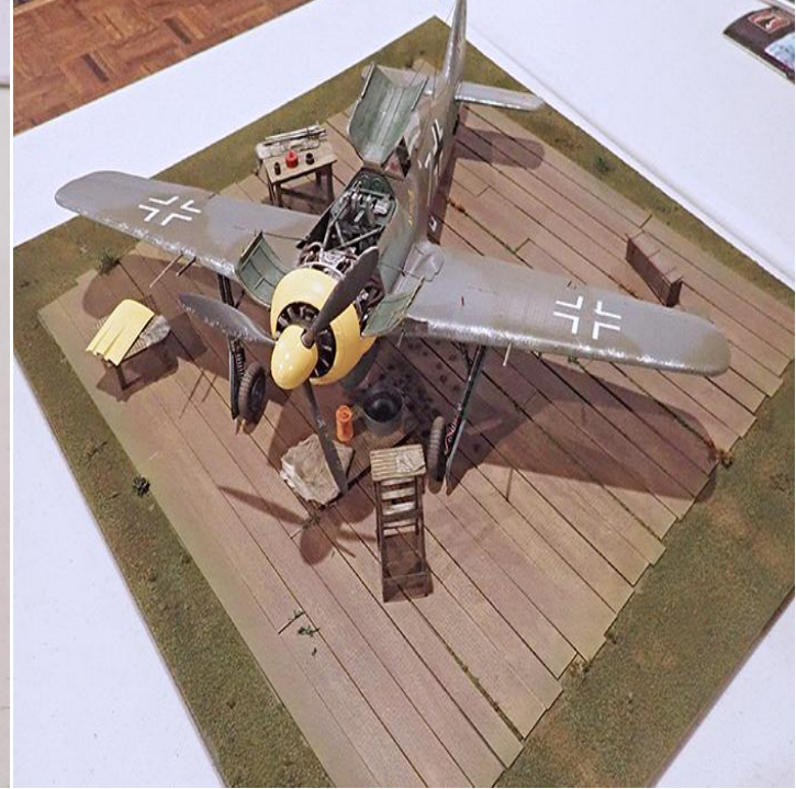
This super-detailed FW-190 was in 1/32 scale!