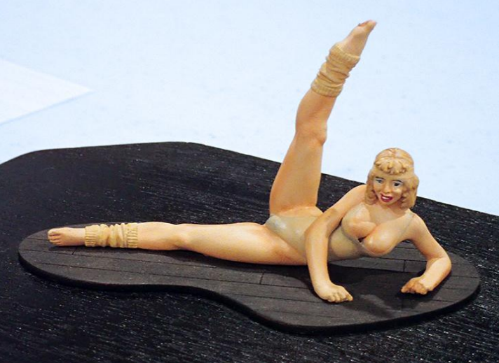
Big Bill's favorite Nurse!!!!! LOL