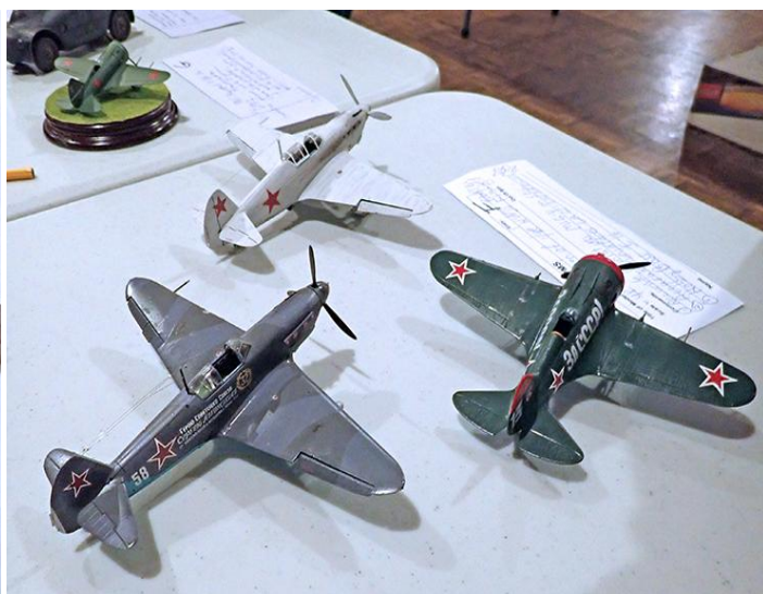
Dynamic Battle Scene