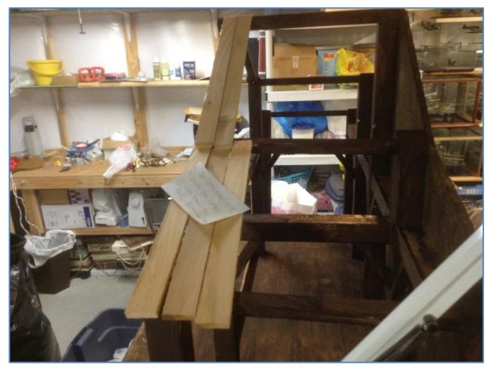
the base measures 2 foot by 4 foot, its 30 inches high and weighs 35 pounds.

was brushed on, used almost the whole quart can by the way. As an aside, this stain gave me a splitting headache and stunk up my shop. That's why I'm a total user of acrylic paints in my modeling activities. Deb also picked out the lighting for the manger and I installed it, using a 3/4 inch hole saw (another seldom used modeling tool!) to cut access holes for the plugs. The holes were plugged with straw matting. Deb finished the manger with grass and straw matting from Michaels (purchased with those famous 50%off coupons) and the project completed. It now sits in the great room next to the fireplace. If your curious,